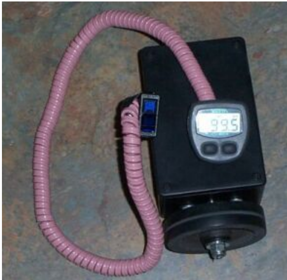
Draft Figure 1: External view of wire feed rate meter